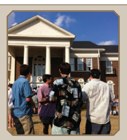
DKE brothers enjoy the band Vegabonds during the pig roast.